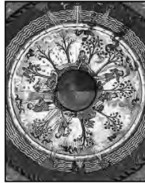
12th century (1163-1173) Medieval depiction of a spherical earth with different seasons at the same time