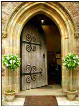
St. Nicolas Church in the Sussex village of Itchingfield

When it comes to music groups, I believe it is important to mold them into a family. A family that cares and is full of grace. Most of our groups are filled with volunteers and their time is important.