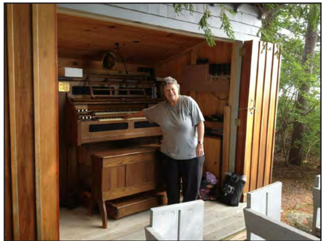
This is a picture from Chocorua Island Chapel, also known as Church Island, on Squam Lake in New Hampshire where she really enjoyed spending time, and sometimes playing!