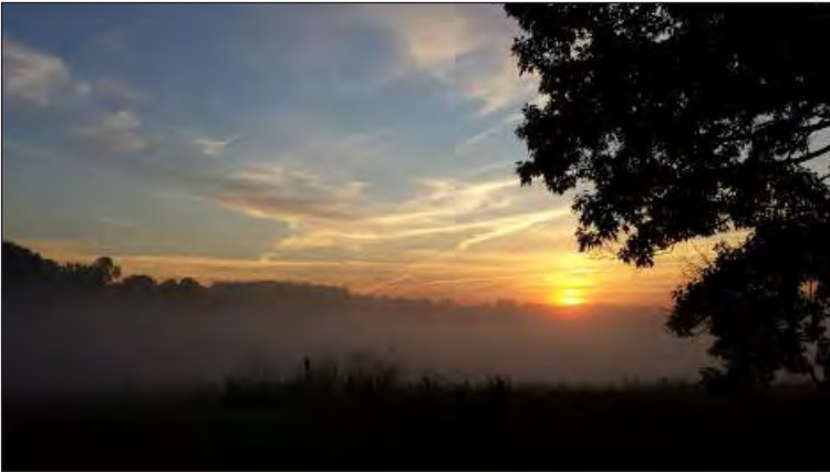
Even after a difficult election, the sun still rises ...