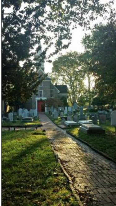
Gloria Dei 'Old Swedes' Church The oldest church in Pennsylvania, established in the 1600's