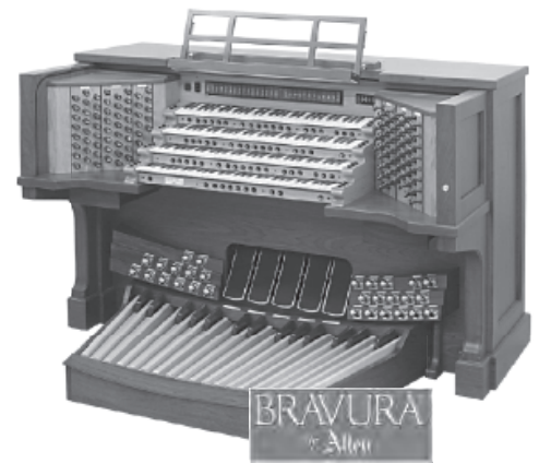
BRAVURA BY ALLEN

CHANCEL™ instruments make it possible for churches with limited budgets to enjoy the legendary sound and quality that has made Allen the world's most chosen church organ.