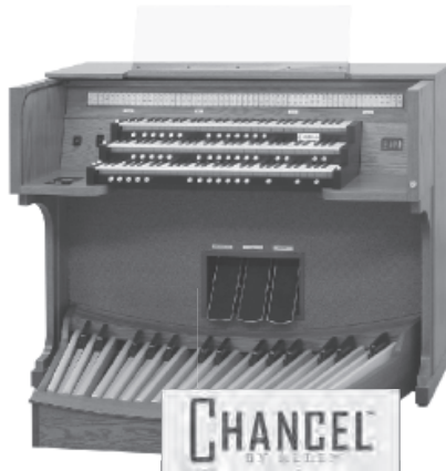
CHANCEL BY ALLEN

CHANCEL™ instruments make it possible for churches with limited budgets to enjoy the legendary sound and quality that has made Allen the world's most chosen church organ.