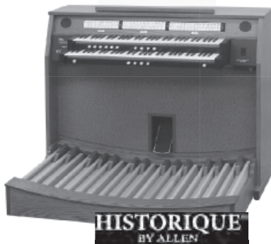
HISTORIQUE BY ALLEN

Designed to fit smaller spaces and budgets yet with uncompromising Allen materials and tonal quality. HISTORIQUE™ models offer the flexibility of from 4 - 9 organ specifications. Hear the HISTORIQUE for yourself at: https://goo.gl/eQz5Nh