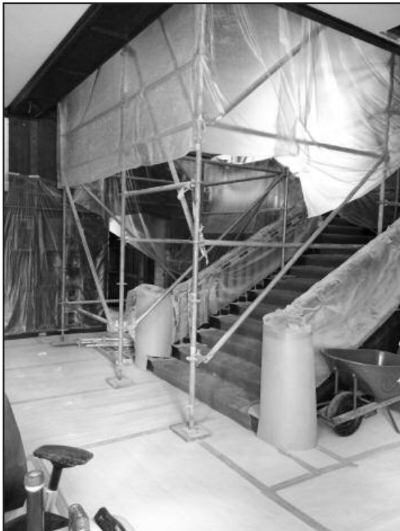
Stairway to Second Floor