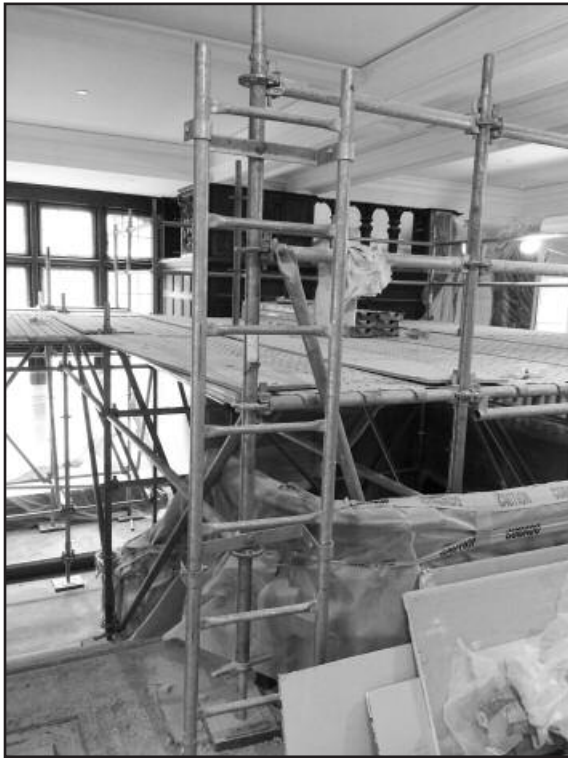
Scaffolding above Grand Stairway