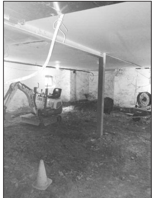
Basement Organ Chamber